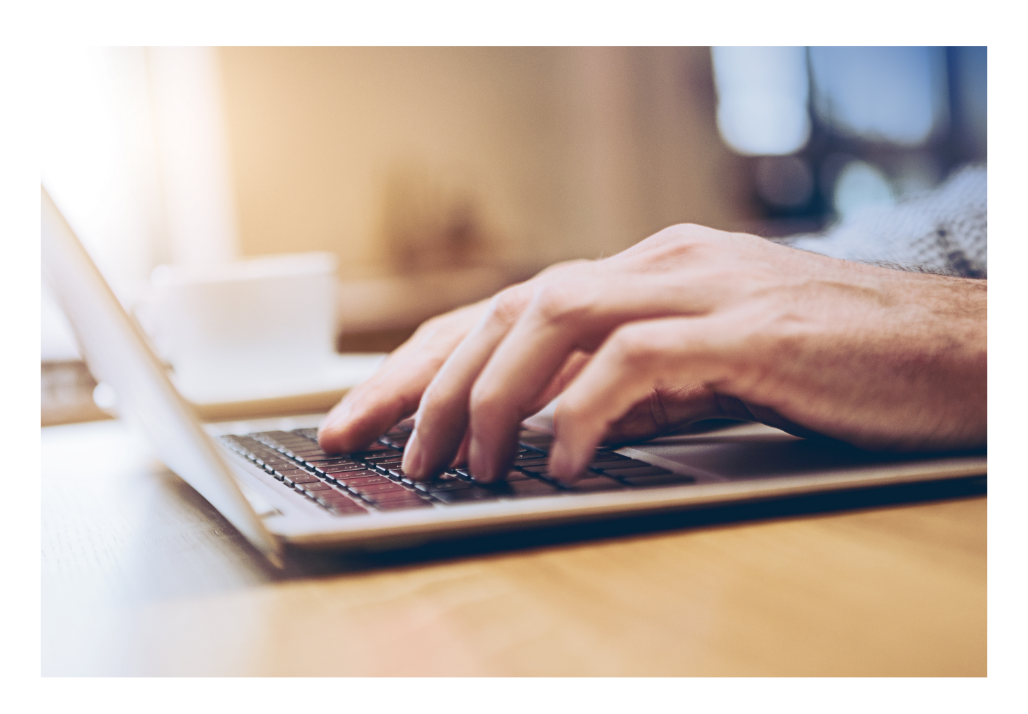
Florida Online Intake